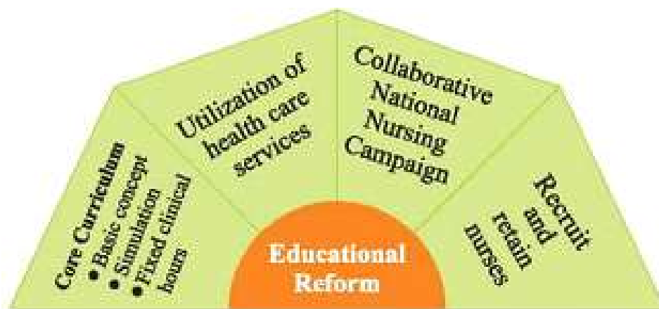
Fig. 2: Educational reforms in Nursing

In order to perform evidence-based practice, we need evidence. With nurses' knowledge and skills they can theorize, hypothesize, formulate studies and gathers evidence that result in standard care. The goal of nursing research is to achieve better care standards and application for patients and families. As nursing students are the future members of the nursing profession and for the profession to continue to advance, nursing research must be