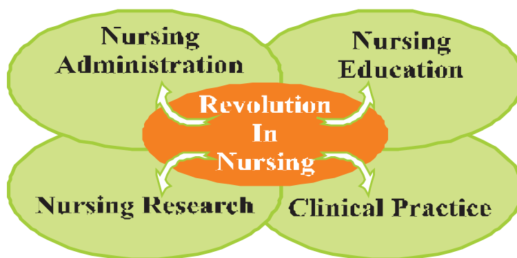
Fig. 1: Revolution among four major areas of Nursing

powerful allies who will attract countless others to your cause. They possess a down-to-earth professionalism that is sincere and authentic and they have firsthand knowledge of the life or death stakes of the most urgent issues of the day, from income equality to immigration reform to climate change. This article furthers discussion on four major areas of nursing as given in Fig.1.